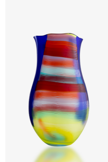
All vases and sculptures are made of Murano glass